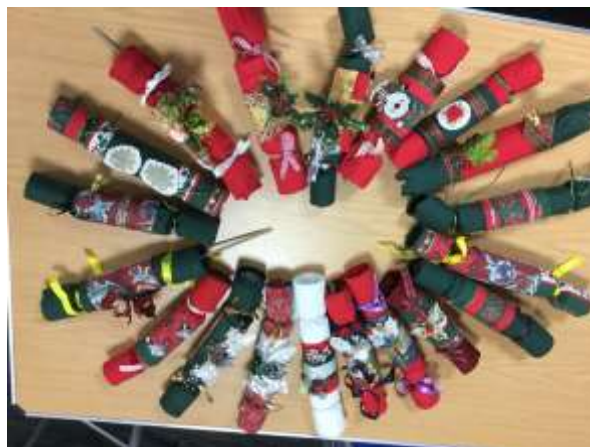
Christmas crackers made by members of the North Horsham Friendship Group