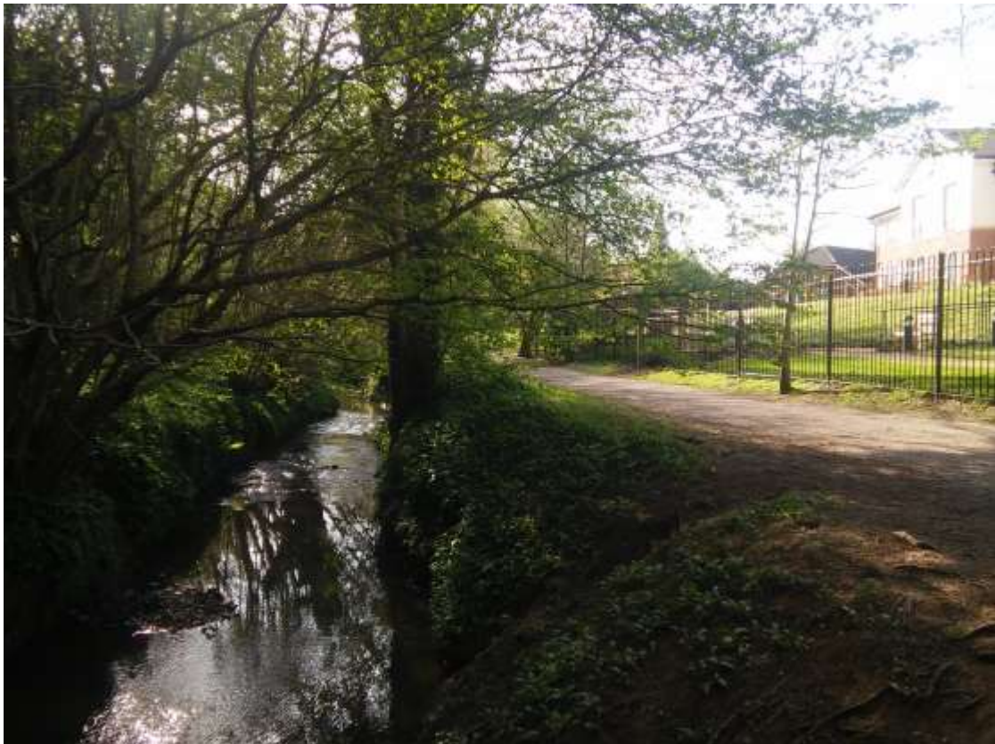
Riverside Walk near North Heath Hall