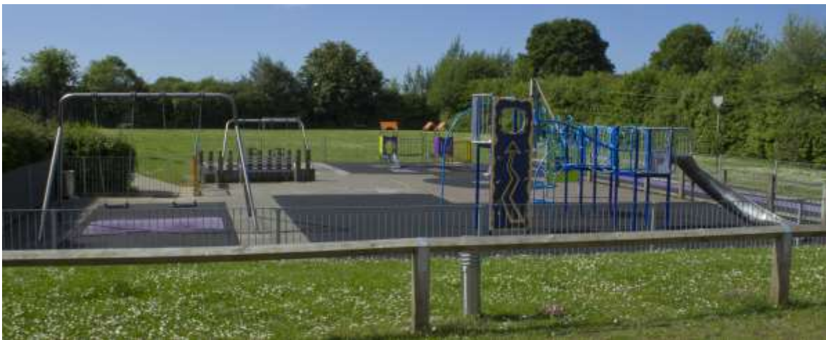
Play area at Holbrook Tythe Barn

During 2020/21 schedules of work and inspection regimes have been undertaken at all Parish Council owned assets including all of the halls, multi courts, street lighting, bus shelters, litter bins, dog bins and notice boards.