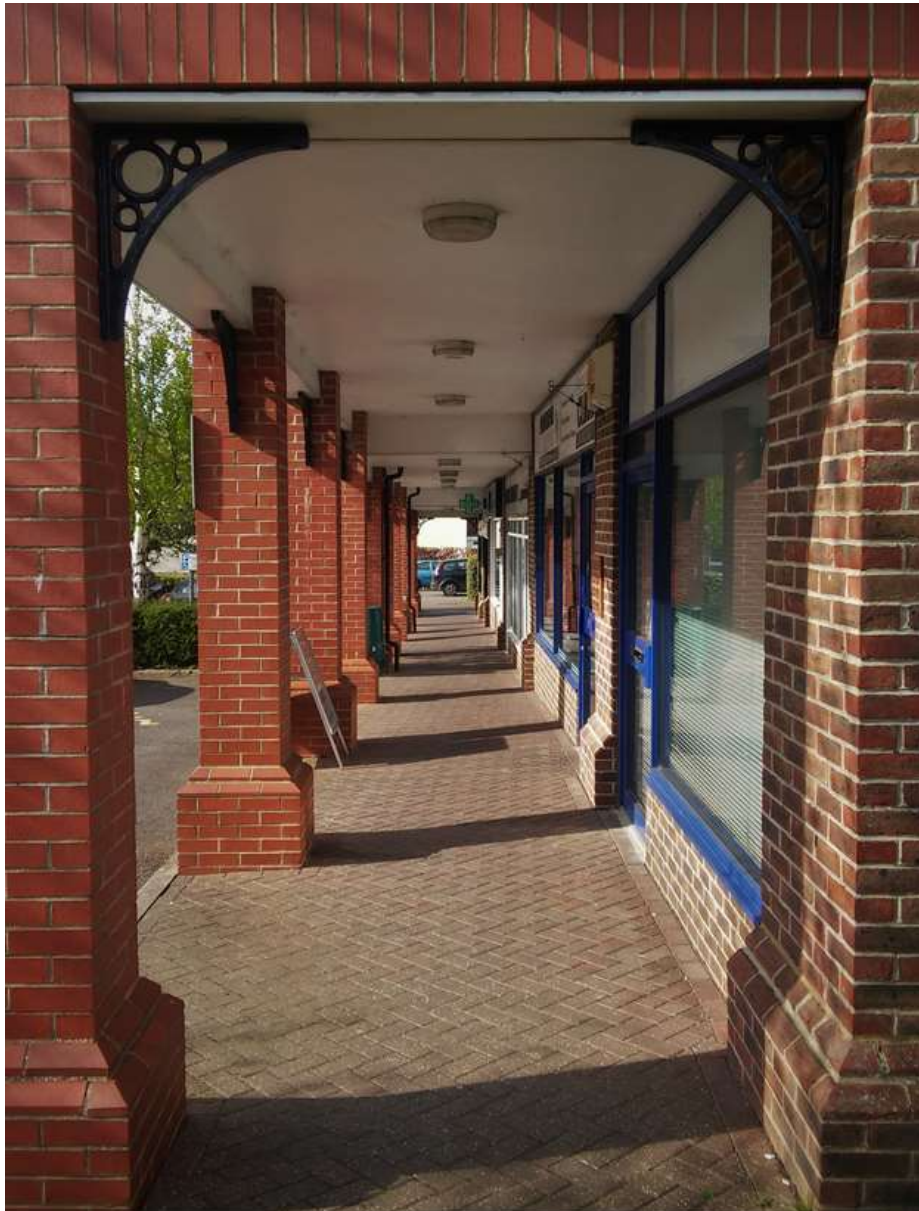
Shops at Bartholomew Way.