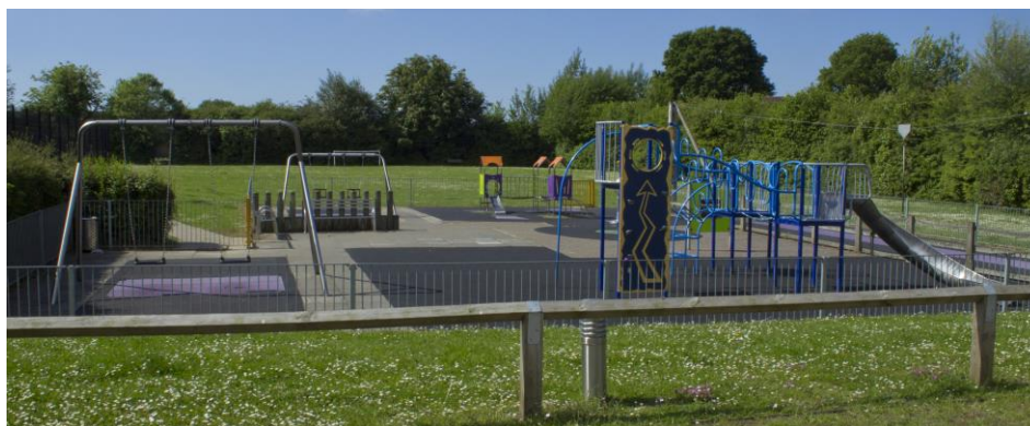
Play area at Holbrook Tythe Barn

The playgrounds continue to be popular and there is an ongoing schedule of maintenance and inspection. The 30 Parish Council owned allotments are all occupied and there are 6 people on the waiting list. The allotments are inspected regularly.