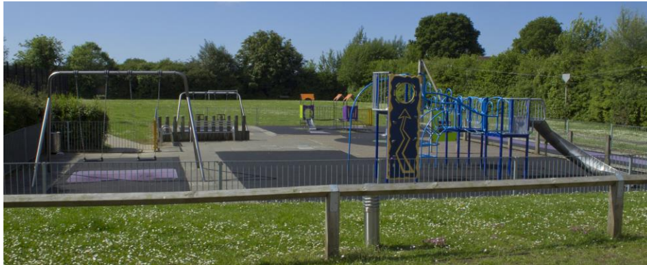
Play area at Holbrook Tythe Barn

The playgrounds continue to be popular and there is an ongoing schedule of maintenance and inspection. The 30 Parish Council owned allotments are all occupied and there are 4 people on the waiting list. The allotments are inspected regularly.