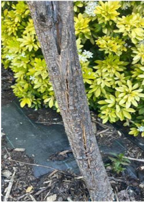
Dead Lilac Tree